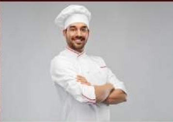
Demi Chef (Continental)