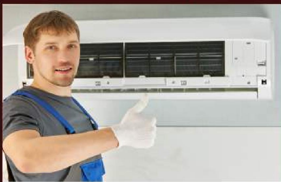
AC (Air Conditioning) Technician