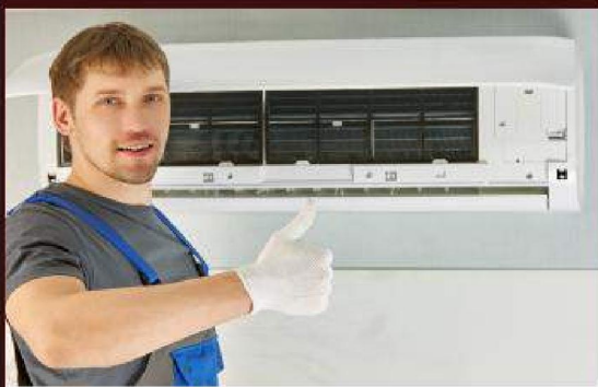
AC(Air Conditioning) Technician