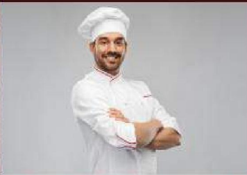
Demi Chef (Continental)